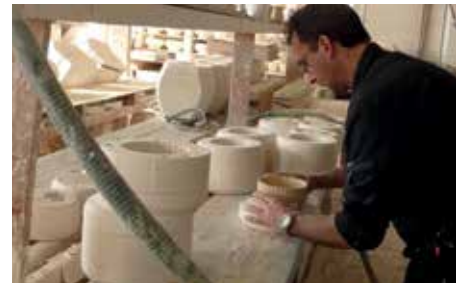
Fabricación de una pantalla de porcelana del modelo Brahma.

Seguir aprendiendo de este noble oficio y ponerlo de nuevo en valor de la mano de arquitectos y diseñadores de iluminación,