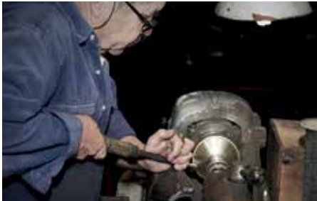
Repulsado artesanal de la lámpara Dust.

Durante más de 50 años, de los talleres de Pedret Barcelona han salido excepcionales lámparas de fundición elaboradas por algunos de los mejores artesanos del metal. Cada elemento, cada proceso, desde la fundición de los lingotes a su pulido, mecanizado, baño y montaje, se realizan con cuidado y destreza, conscientes que cada detalle, alberga el secreto de una obra excepcional.