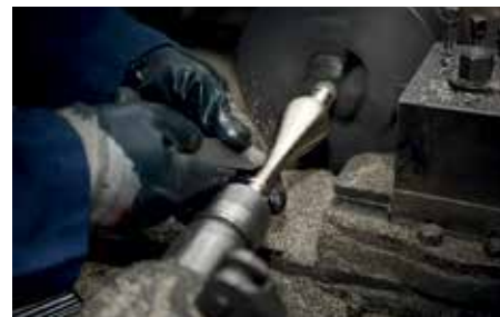
Mechanization of an ornamental element from Lorraine collection.

To continue learning this noble craft and to enhance its value with the help of architects and lighting designers, is the next