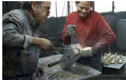
Trabajo de fundición a partir de un lingote de latón.

Entre algunos de los proyectos más emblemáticos en los que hemos trabajado, destaca la colaboración con el Hotel Burj AlArab, en Dubai, considerado el hotel más lujoso del mundo, pero también fantásticos rincones de pequeños hoteles y