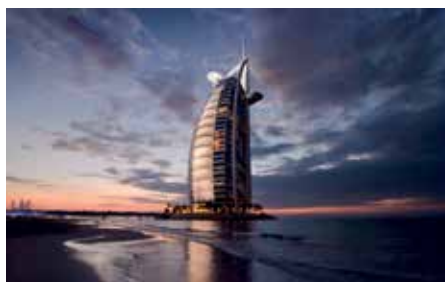
Burj Al Arab Hotel in Dubai, equipped with several lamp collections from Pedret Barcelona.

Noteworthy among our most emblematic projects are the collaboration with the Burj Al Arab Hotel in Dubai, considered to be the most luxurious in the world, but also fabulous corners in small hotels and restaurants spread around the world,